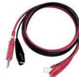
9615-01 H.V. TEST LEAD (red: high voltage side) 9615-02 H.V. TEST LEAD (black: return side)